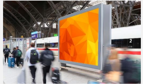
ML / MLS